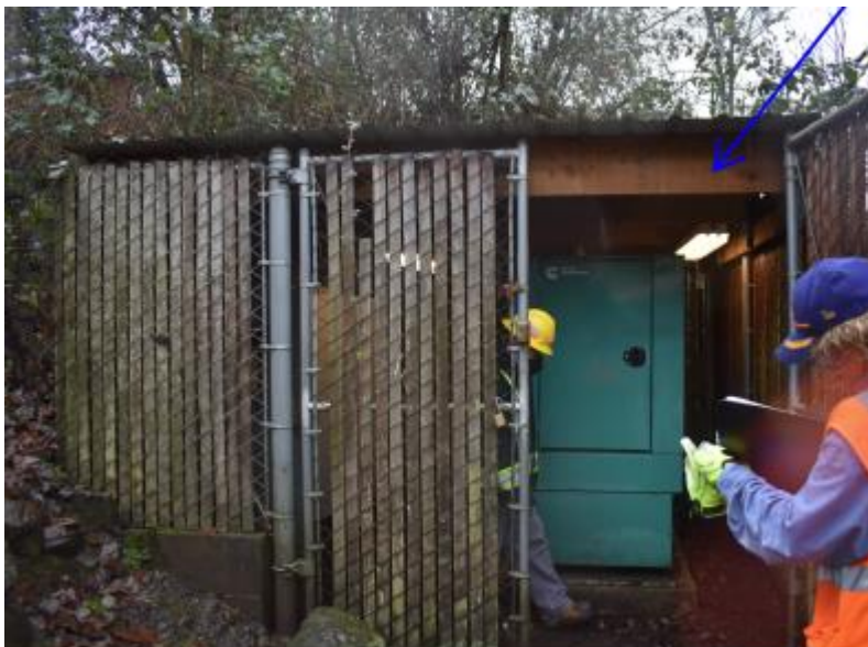
PS 15 – Generator Enclosure